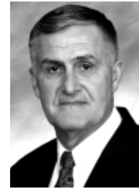
General Henry Hugh Shelton

General Henry Hugh Shelton, U.S. Army, Retired, served as the 14th chairman of the Joint Chiefs of Staff from 1997 until his retirement in 2001.