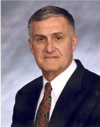
General H. Hugh Shelton

USA (Ret.) 14th Chairman, Joints Chief of Staff